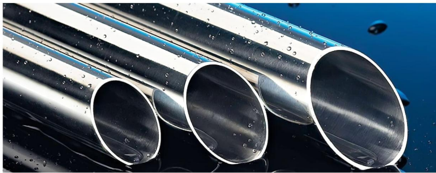
卫生级管道尺寸对照表 Sanitary pipe size comparison table

Our advanced clean pipeline adopts the international leading hydraulic test system, mechanical performance test system, crystal phase analysis system, strict control of pipeline size, strict control of tolerance size.